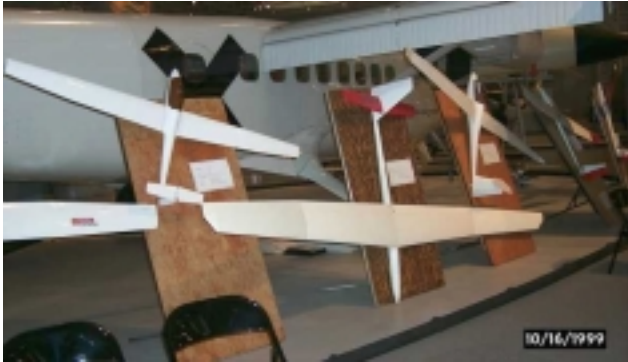
Gliders from ORCC