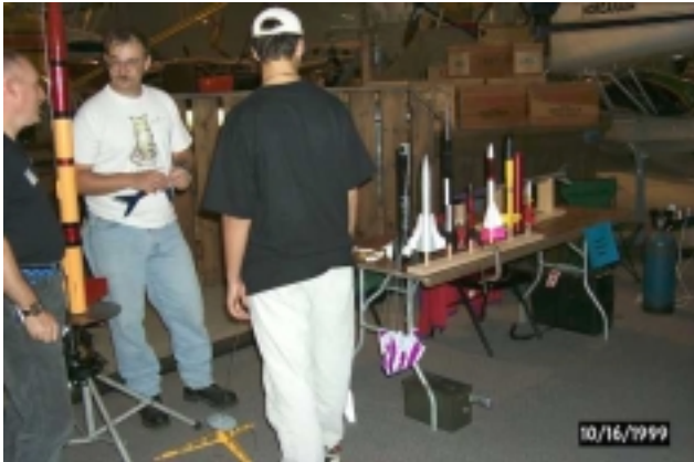
The Ottawa Rocketry Club had an amazing display of their rockets.